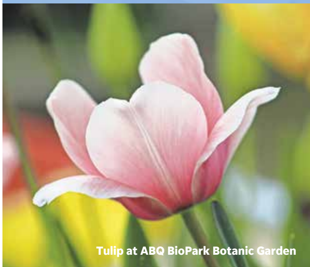
Tulip at ABQ BioPark Botanic Garden

IT'S EASY TO GET LOST IN THE BEAUTY OF NATURE. A single, breathtakingly colorful cacti blossom. A meandering, tree-lined path. A bed bursting with fall chrysanthemums. All have the power to leave you feeling renewed. Wondering where to find such a natural refresh? The Southwest is home to many of the country's finest botanical gardens, where experts curate beds and create displays so beguiling, you may never want to leave. Here are some of the best: