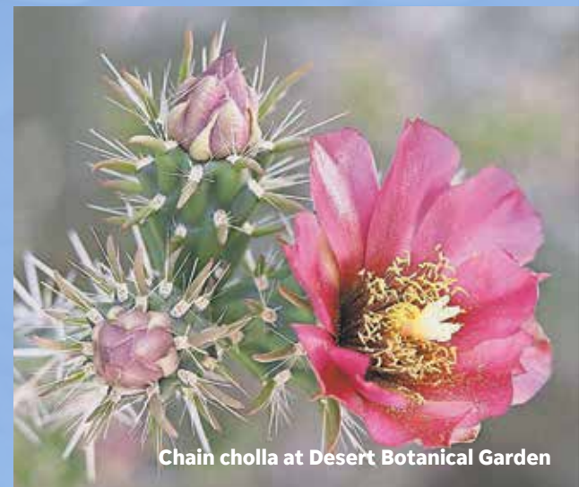
Chain cholla at Desert Botanical Garden