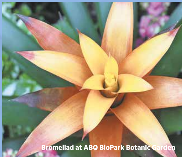
Bromeliad at ABQ BioPark Botanic Garden