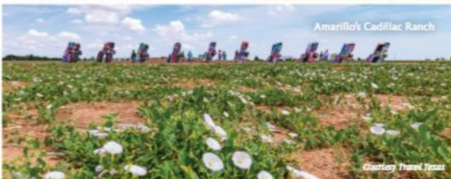
Amarillo's Cadillac Ranch