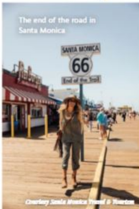
The end of the road in Santa Monica