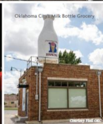
Oklahoma City's Milk Bottle Grocery