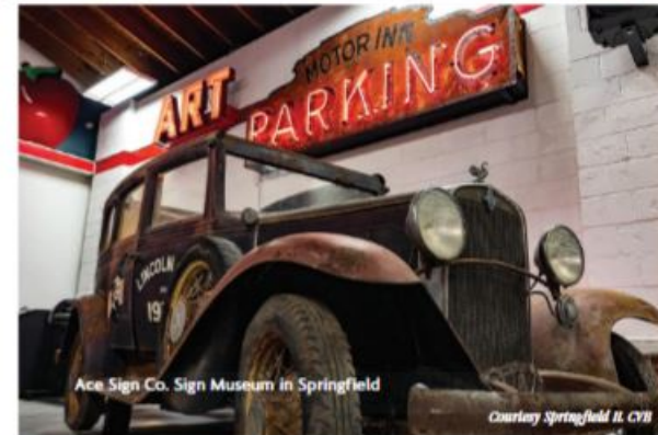
Ace Sign Co. Sign Museum in Springfield