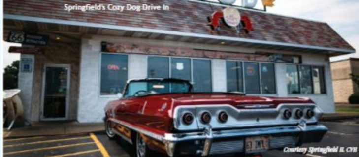
Springfield's Cozy Dog Drive In