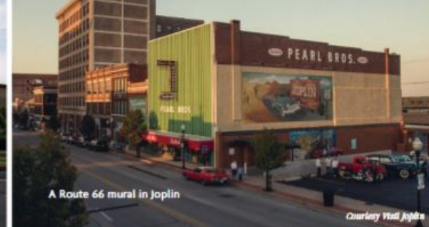
A Route 66 mural in Joplin