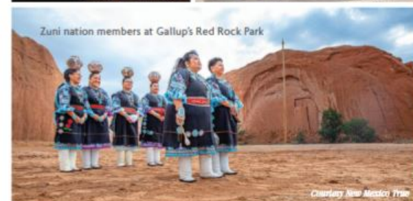
Zuni nation members at Gallup's Red Rock Park