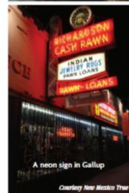
A neon sign in Gallup