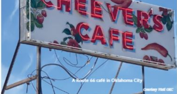
A Route 66 café in Oklahoma City