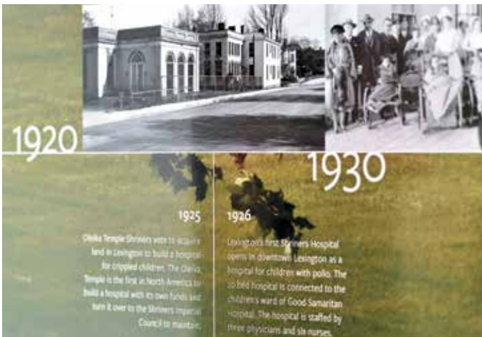
Shriners began at Good Samaritan Hospital, then moved to a dedicated building on Richmond Road.