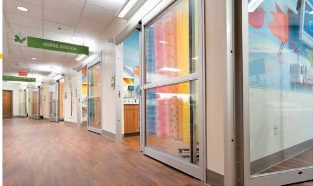
Lexington Shriners Medical Center keeps its patients in mind with bright, children-friendly colors and motifs.

The new facility also includes a high-tech motion analysis center, where young patients' walking movements are digitally tracked and depicted in real-time via