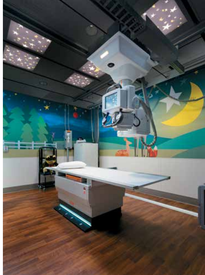
A nighttime motif makes the radiology room more inviting.

In May, Lexington Shriners Medical Center officially dedicated its new, state-of-the-art, $47-million facility off South Limestone Street, directly across from the UK HealthCare Kentucky Children's Hospital. The move from the old campus on Richmond Road to the new location closer to UK was intentional. Shriners Medical Center's physician specialists in the fields of pediatric orthopedics, anesthesia, and rehabilitation also serve on the medical staff at