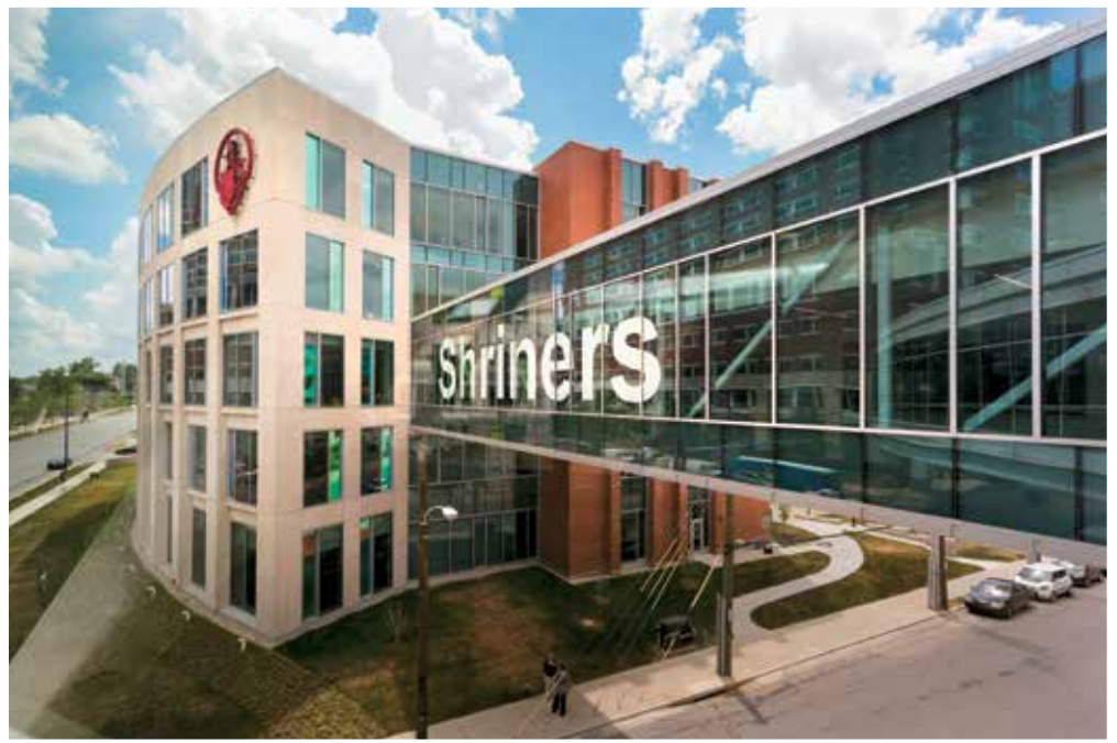
The new Shriners benefits from proximity to the UK HealthCare Kentucky Children's Hospital.