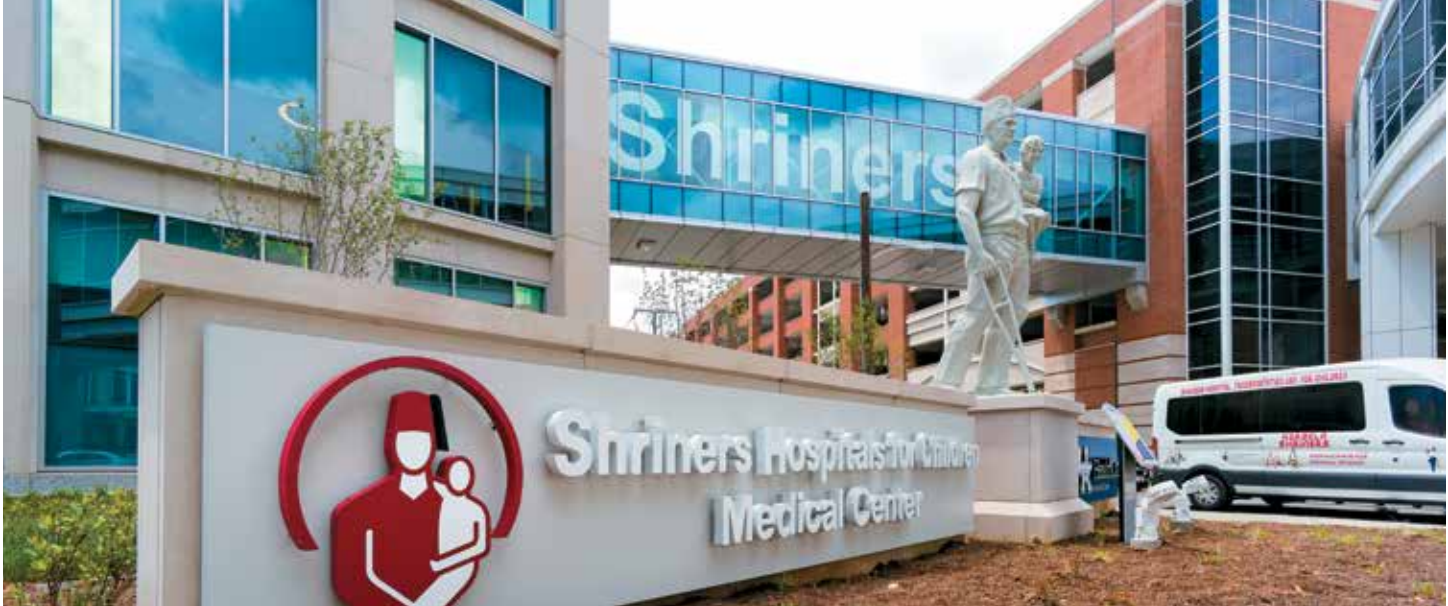
Pedestrian bridges connecting Shriners Medical Center with the Children’s Hospital underscore a longtime collaboration.

surgeries strictly on an outpatient basis, has already resulted in an uptick in patients. In 2016 approximately 11,000 children and teens came to Lexington Shriners to see their physician specialist and receive related services. The new facility has the capacity to care for and treat more than 14,000 children and teens.